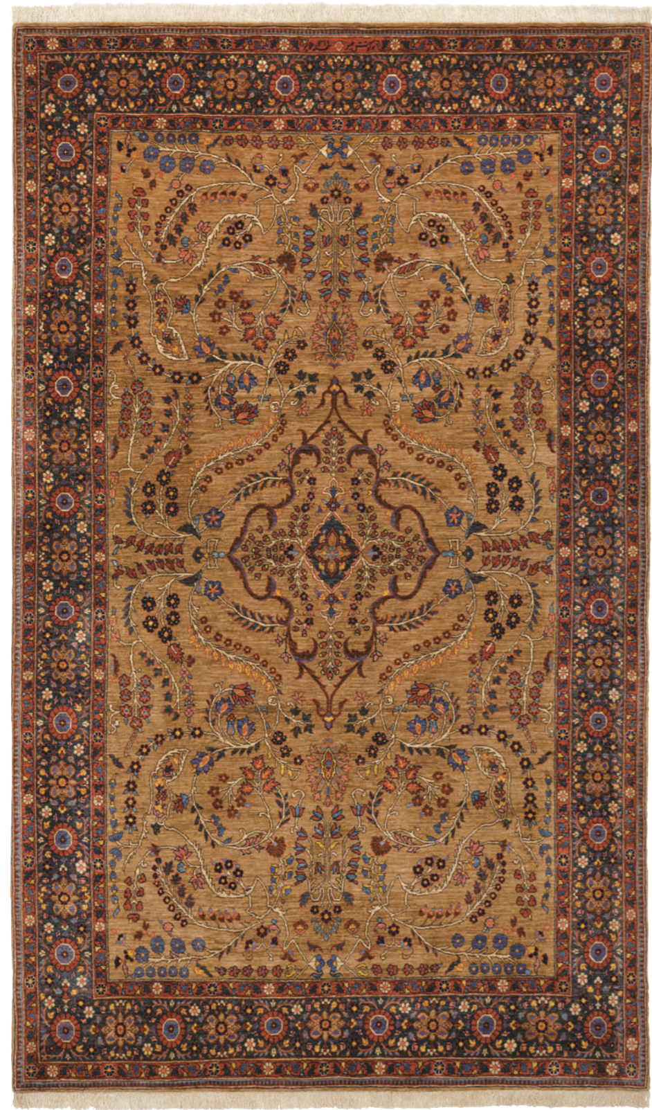
Left Golfam 292x175cm Farahan Wool