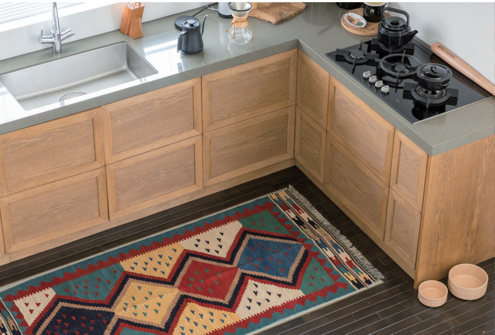
Left Kilim 193×93cm Qashqai Wool Kilim