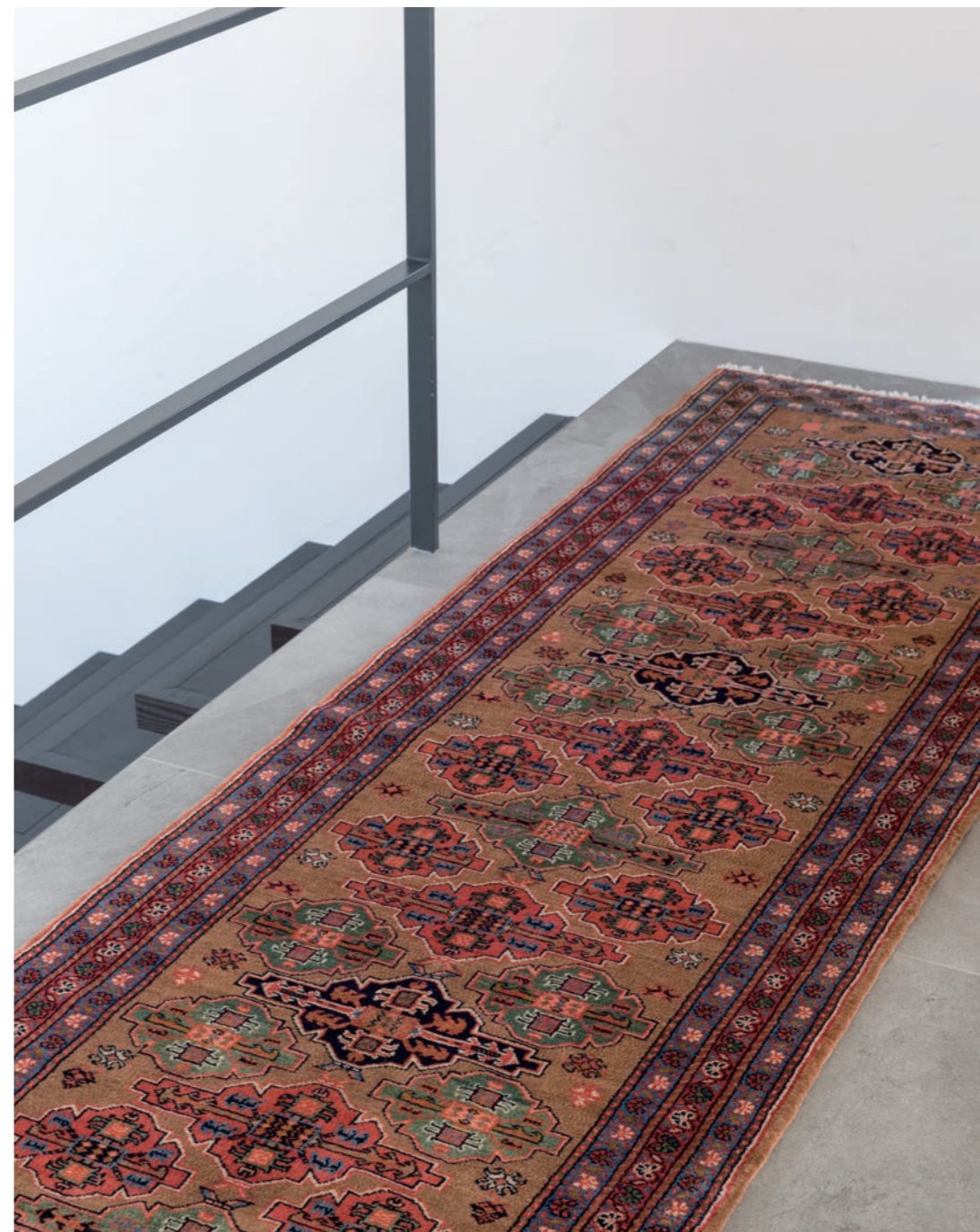
Right Tirgan 308×86cm Gharaghan Wool