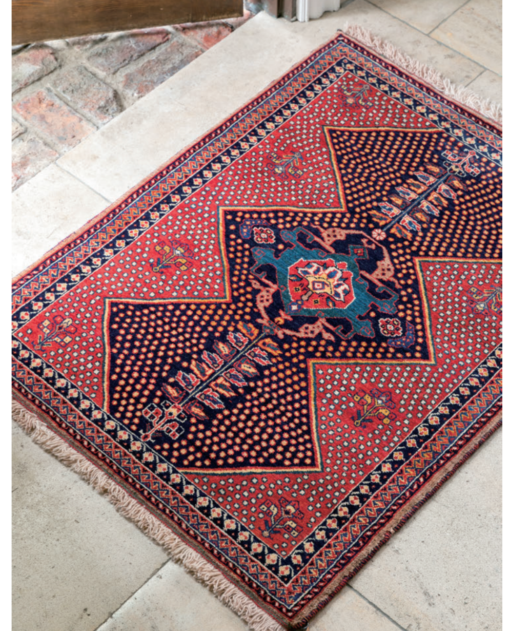
Behtash 112×79cm Qashqai Wool