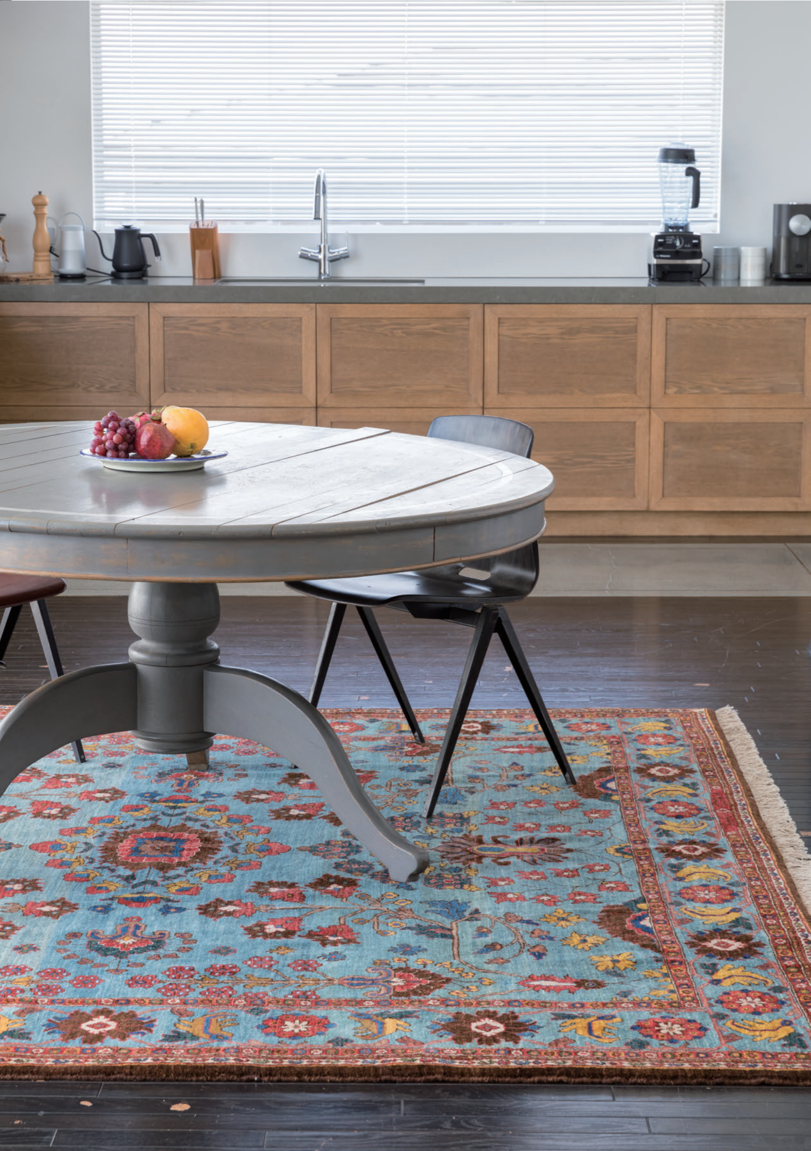
Left Malus 264×240cm Malayer Wool