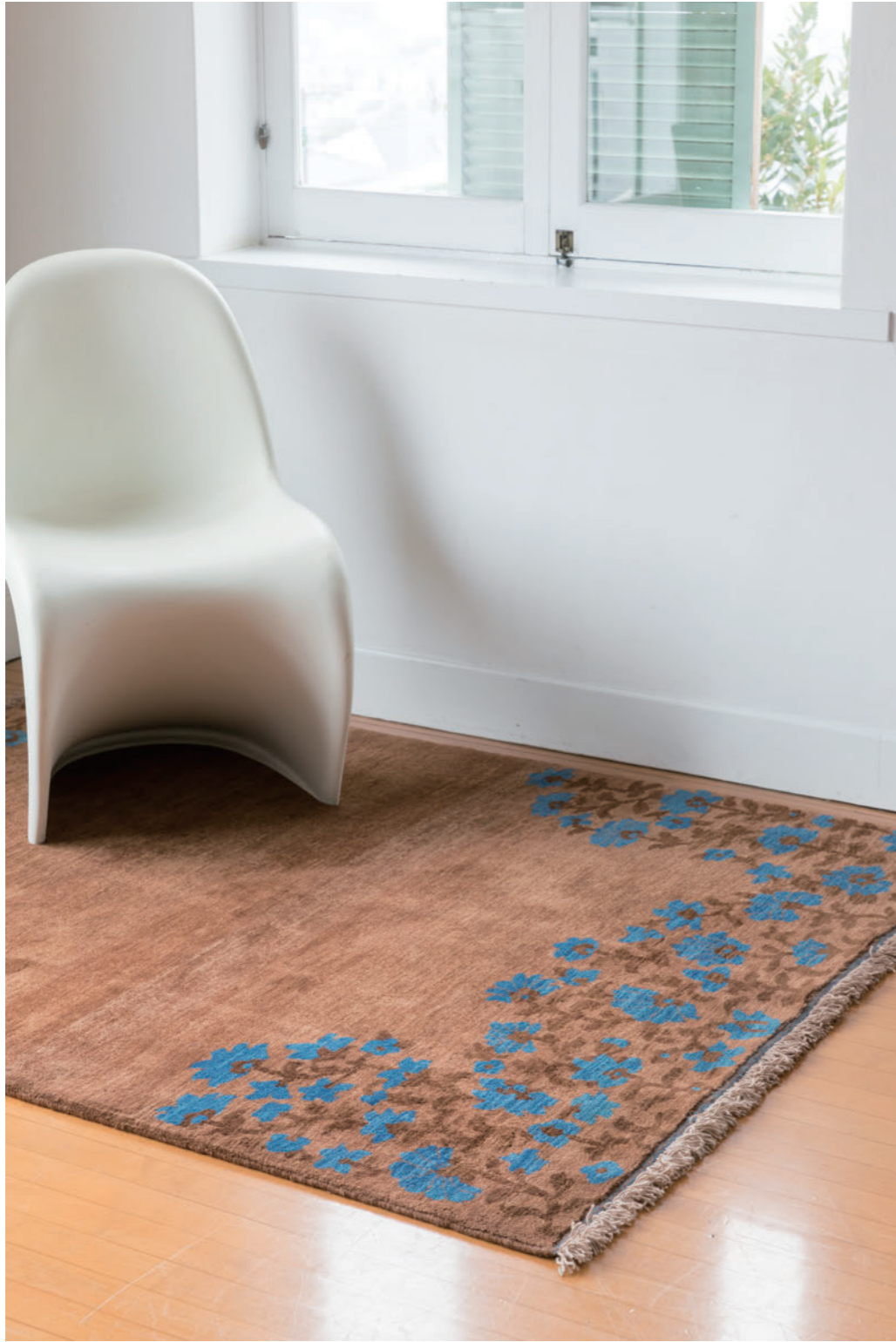
Left Daylan 172×134cm Garrou Wool