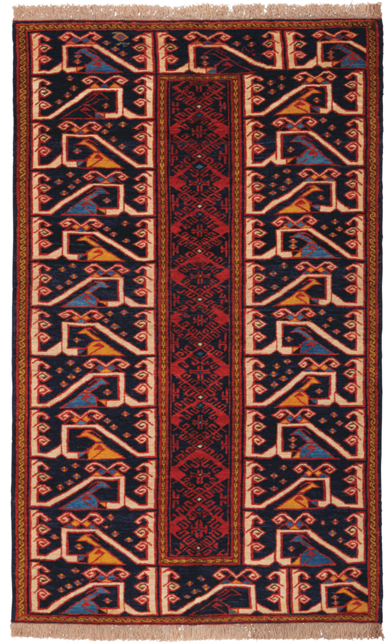
Left Goichak 160x115cm Heriz Wool