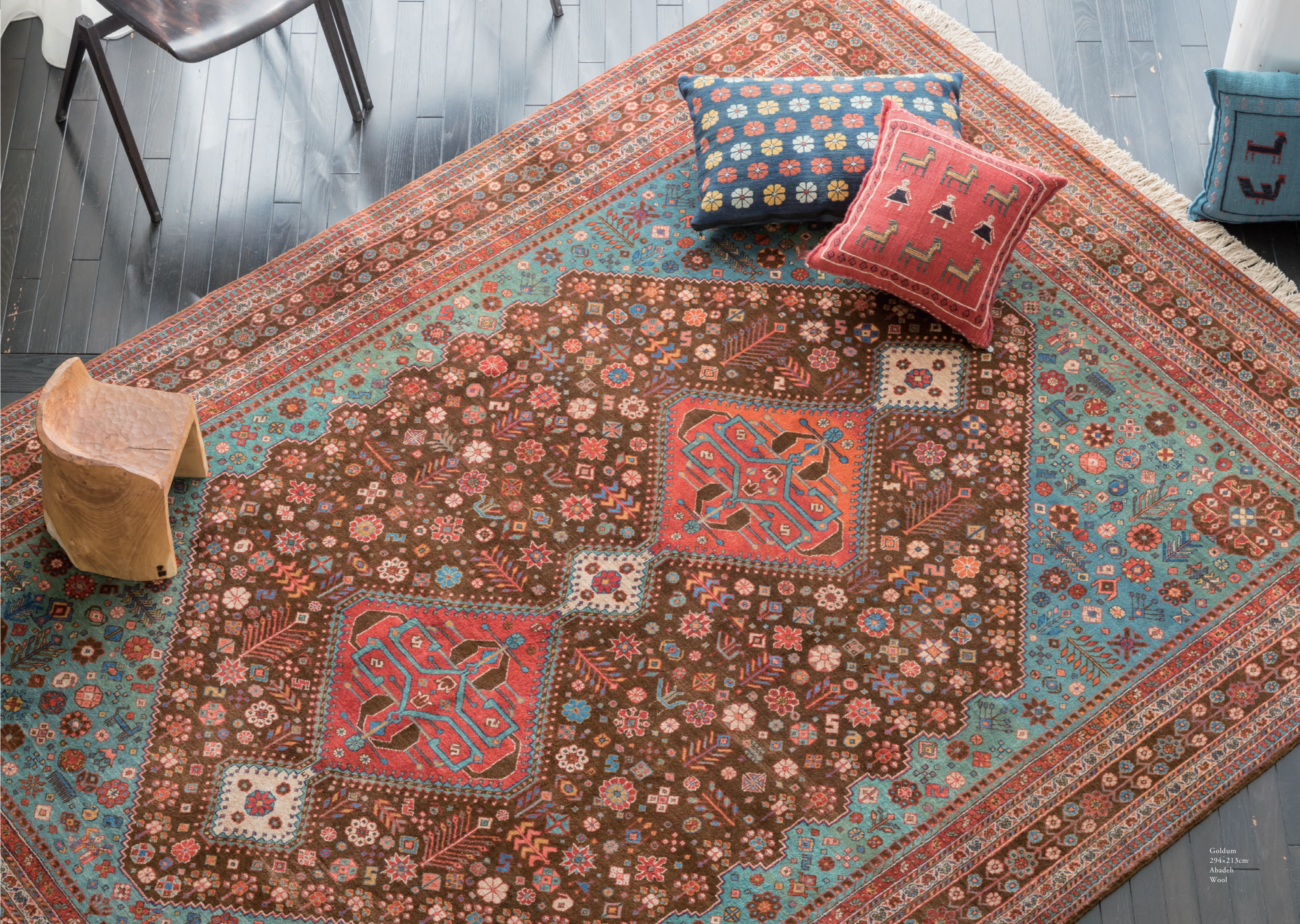
Goldum 294x213cm Abadeh Wool