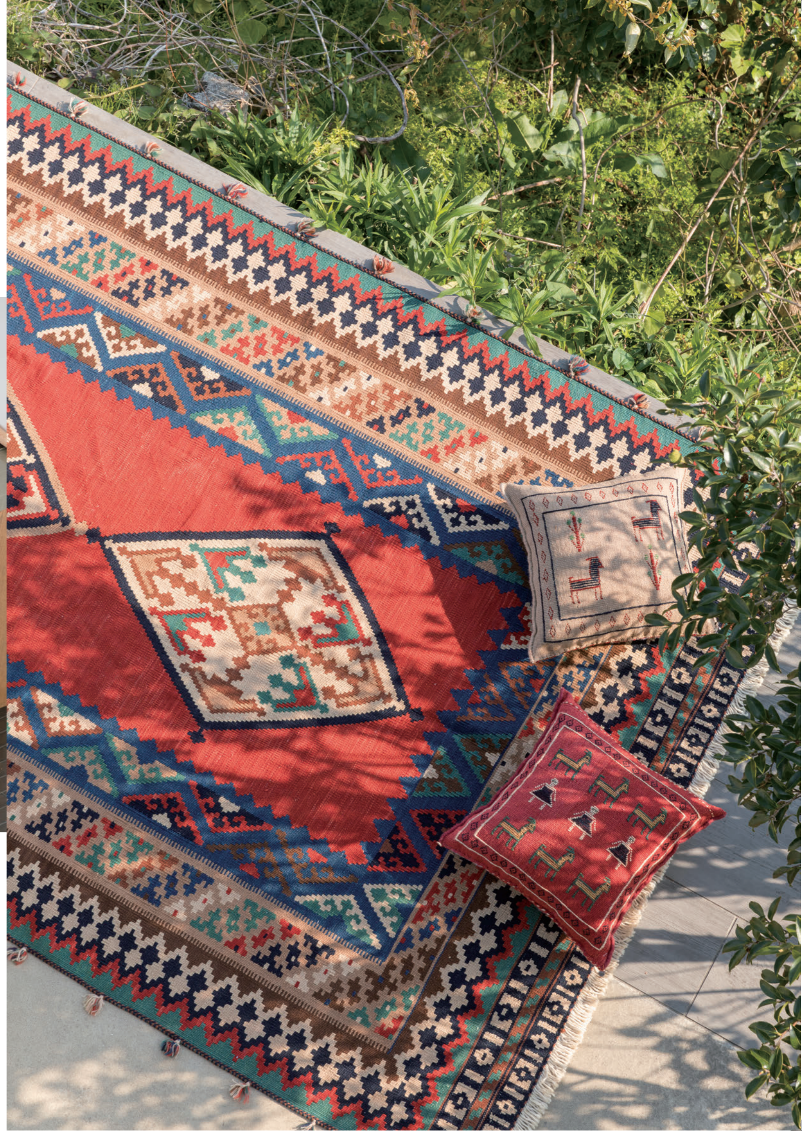
Right K.Q.15 334×161cm Qashqai Wool Kilim