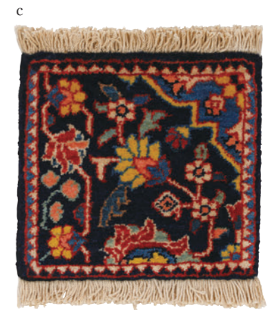
Left Didar 171×130cm Bidjar Wool