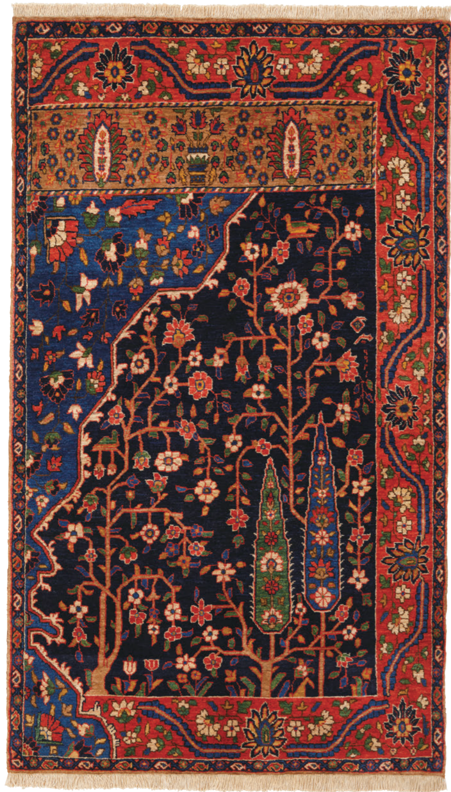
Left Saana 162×94cm Farahan Wool