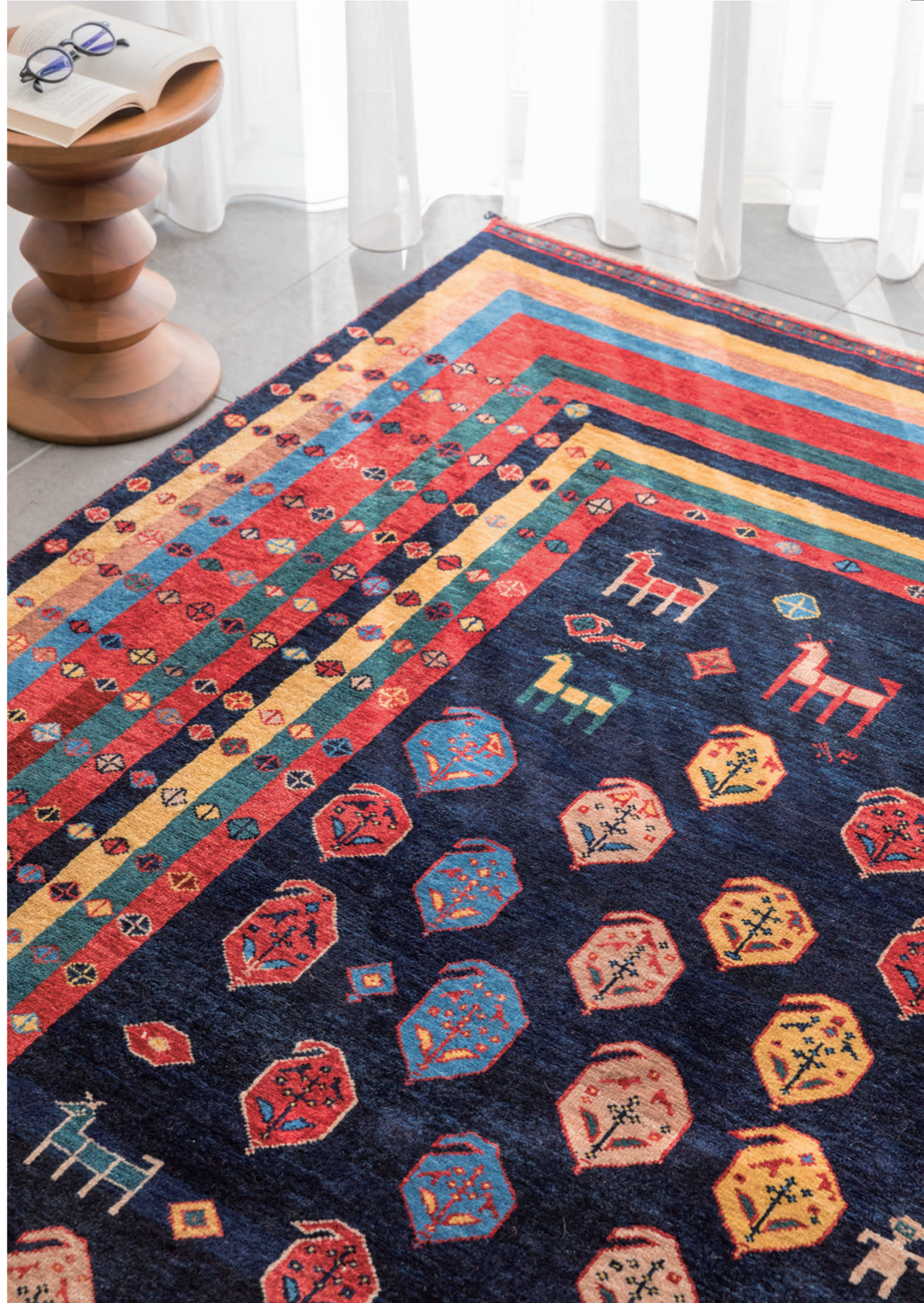
Right Najibeh 233×189cm Qashqai Wool