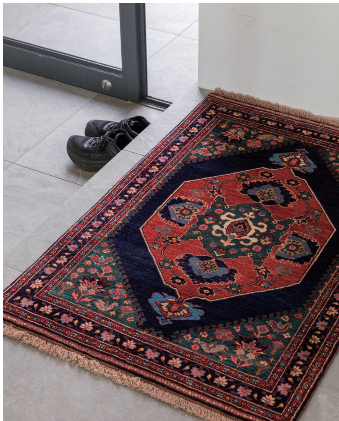
Left Alambaha 116x78cm Qashqai Wool