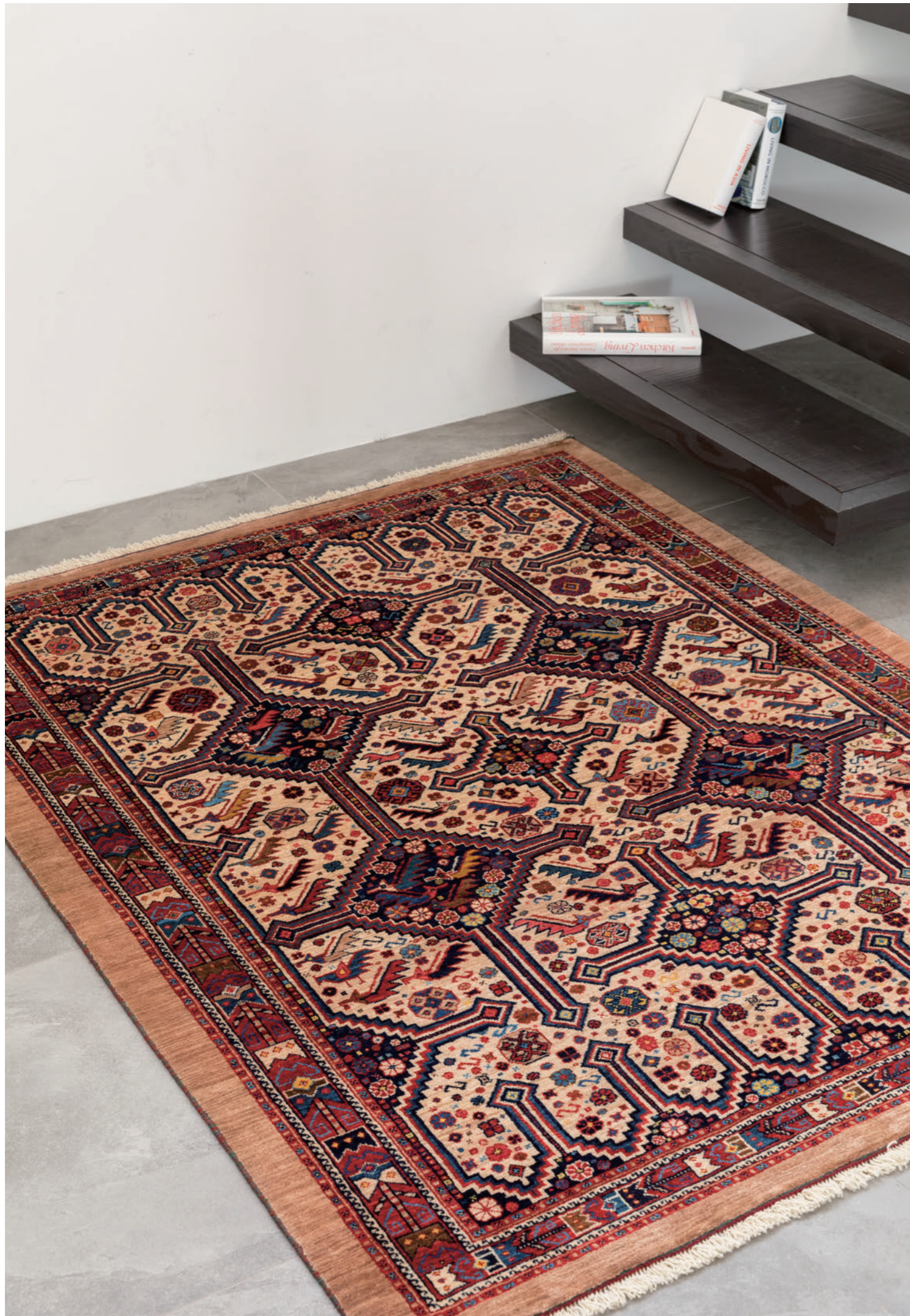
Left Siminroo 178x142cm Arabbaf Wool