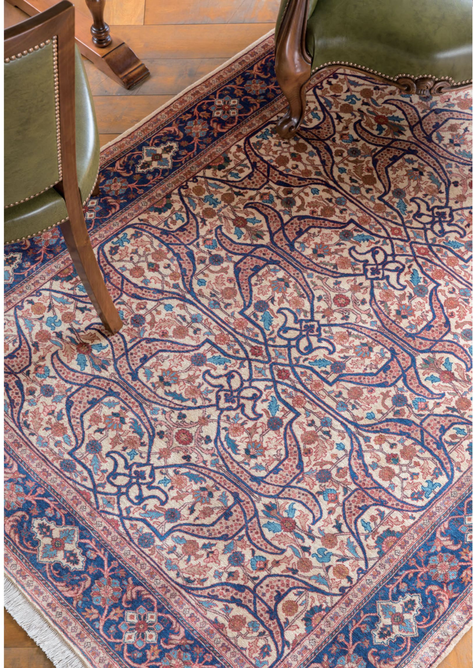
Right Bahaneh 189x135cm Heriz Wool