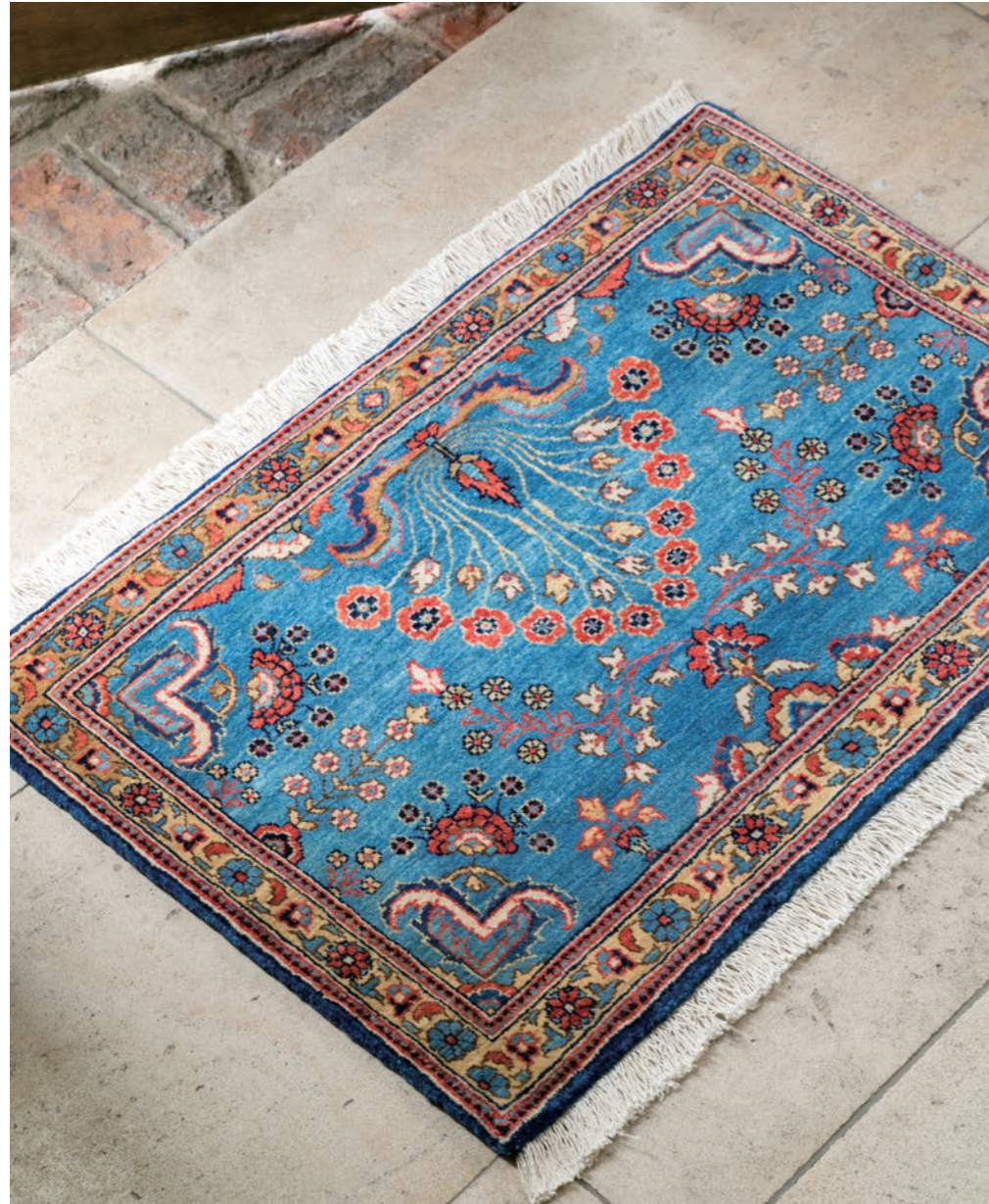
Negin 50×90cm Farahan Wool