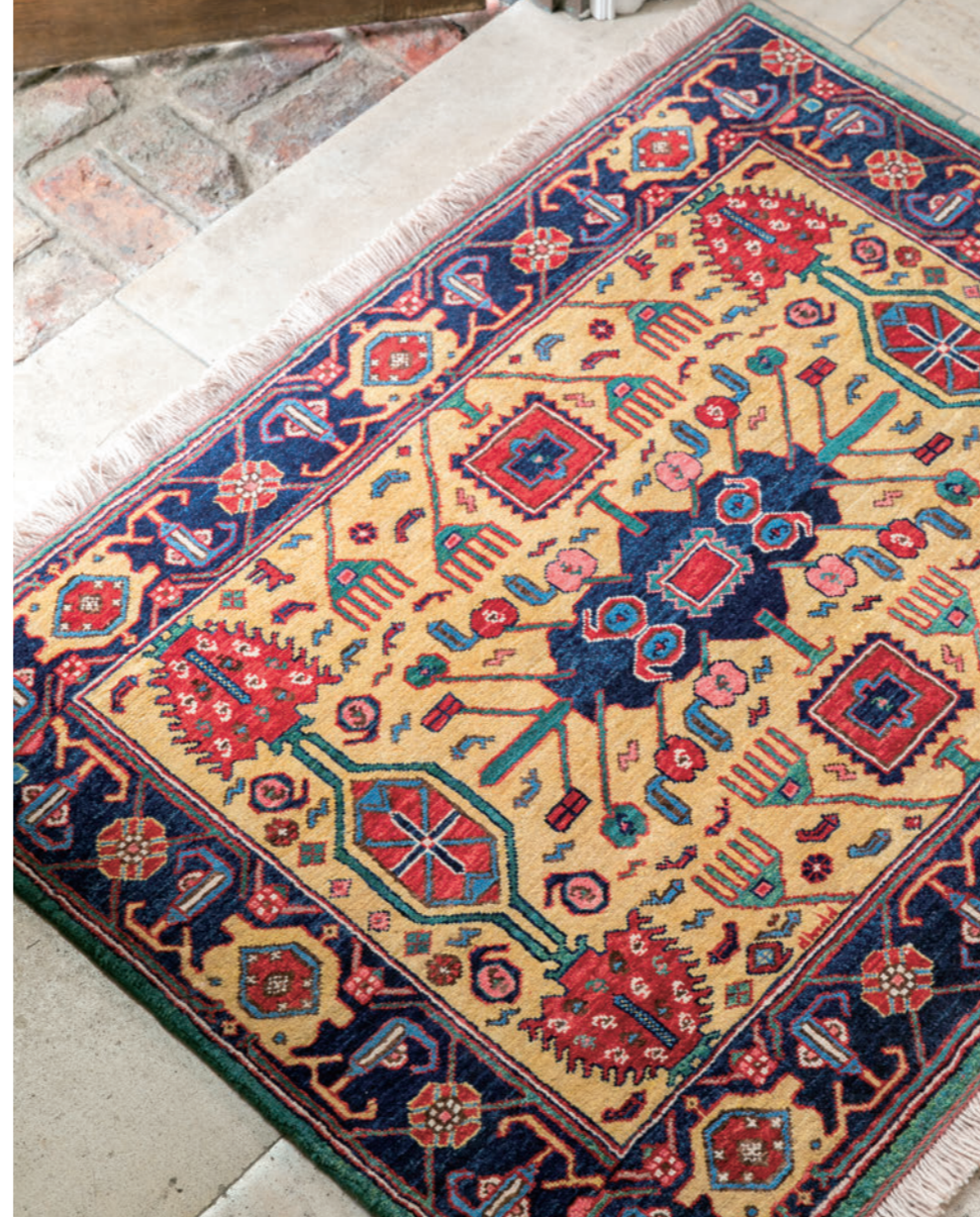
Bujan 88×120cm Garrou Wool