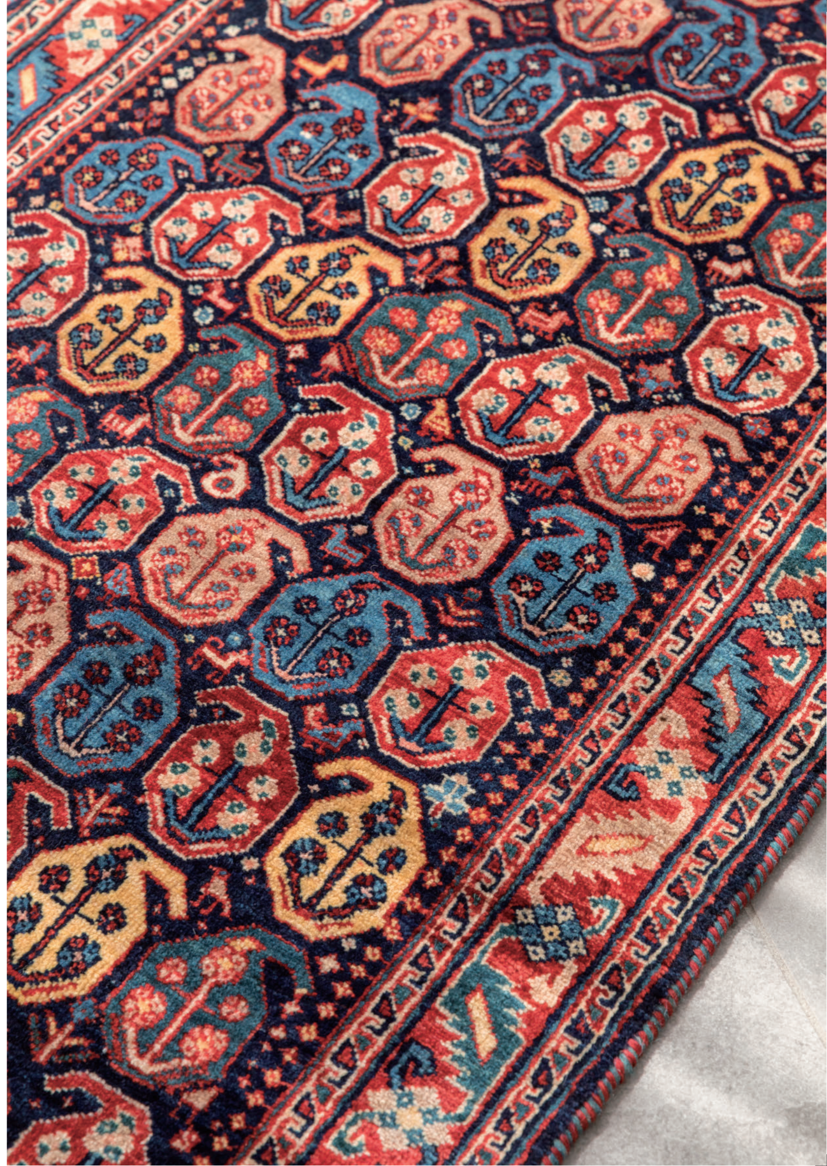
Right Sadaf 138x68cm Qashqai Wool