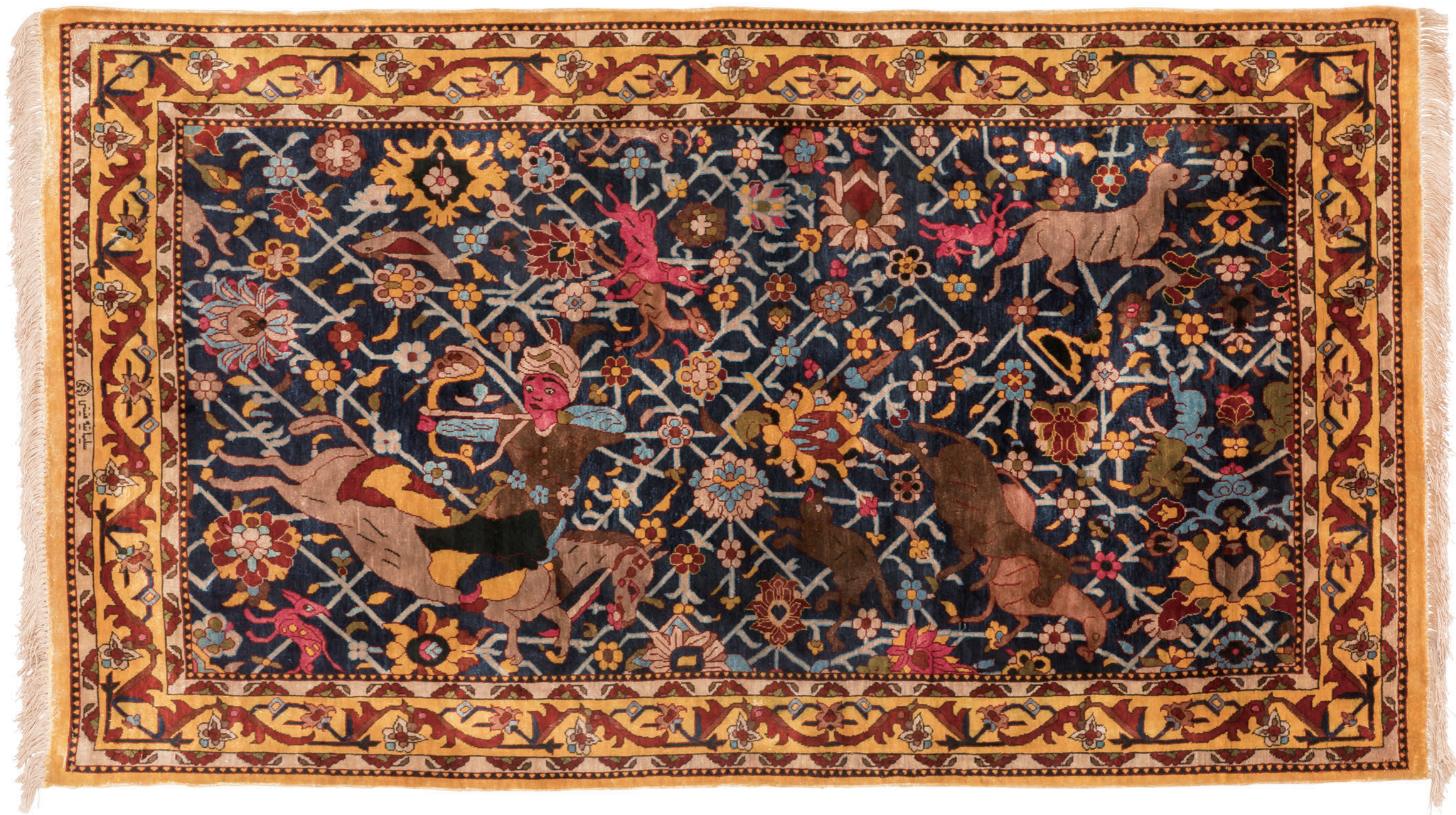
Ochi 148x84cm Tabriz Silk