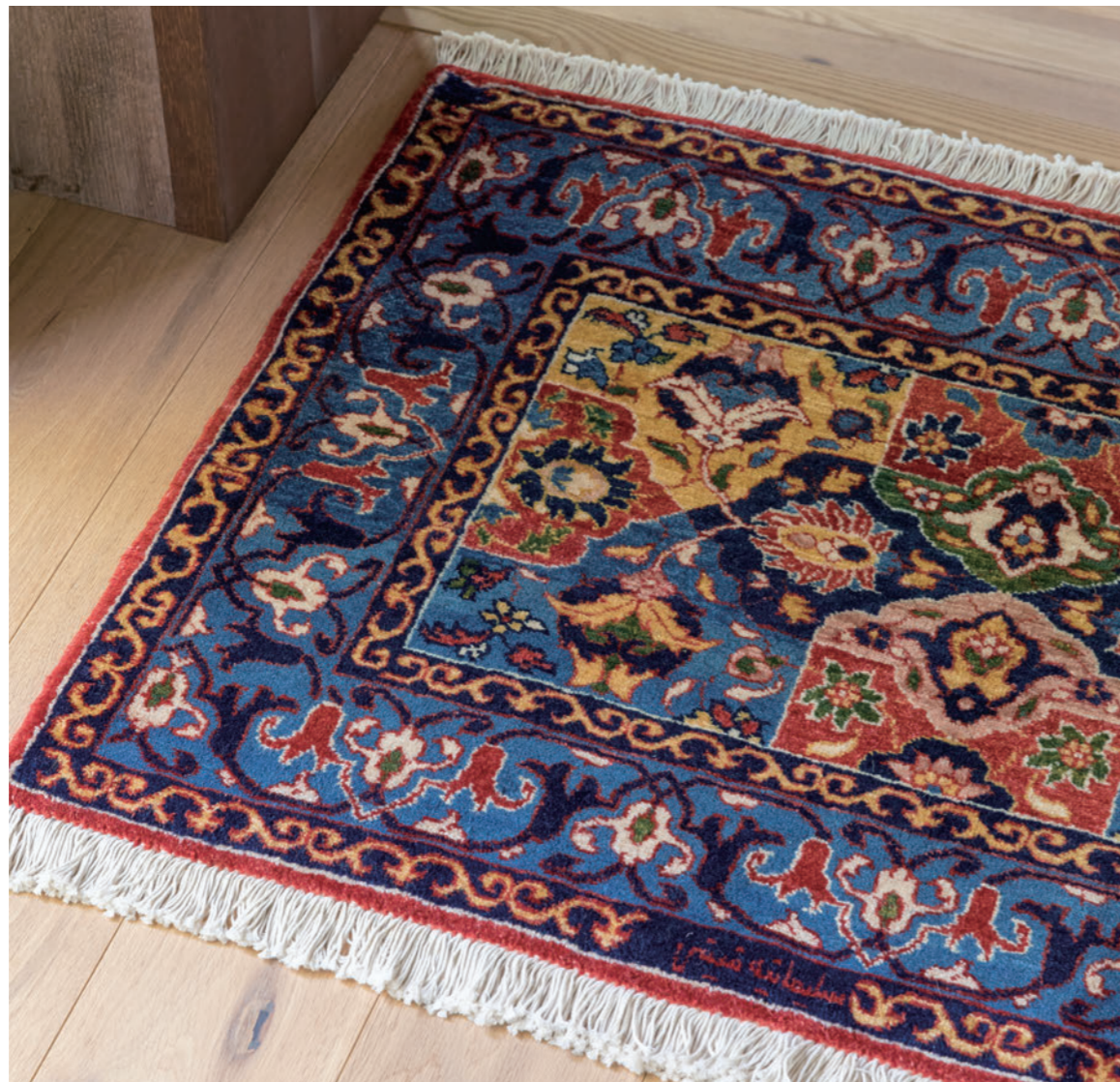
Golosh 73x100cm Tabriz Wool