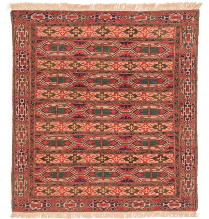
Left Yaradan 192x121cm Azerbaijan Wool Sumak