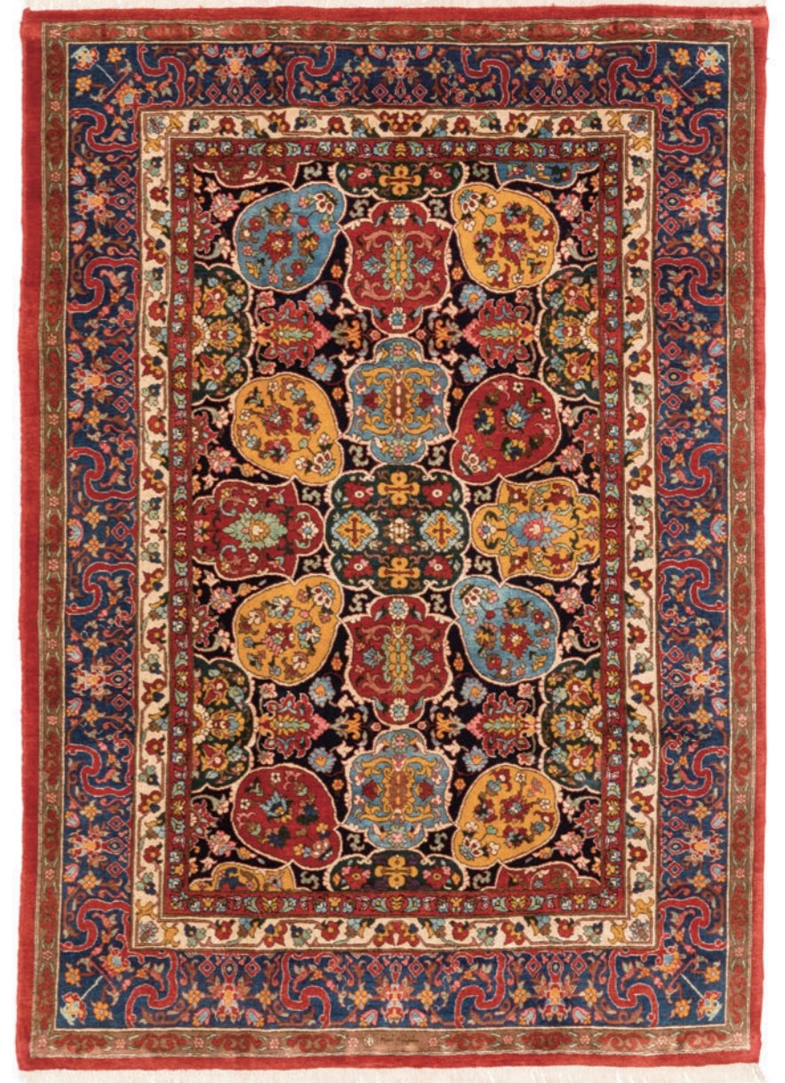
Geytaran 203x141cm Tabriz Wool