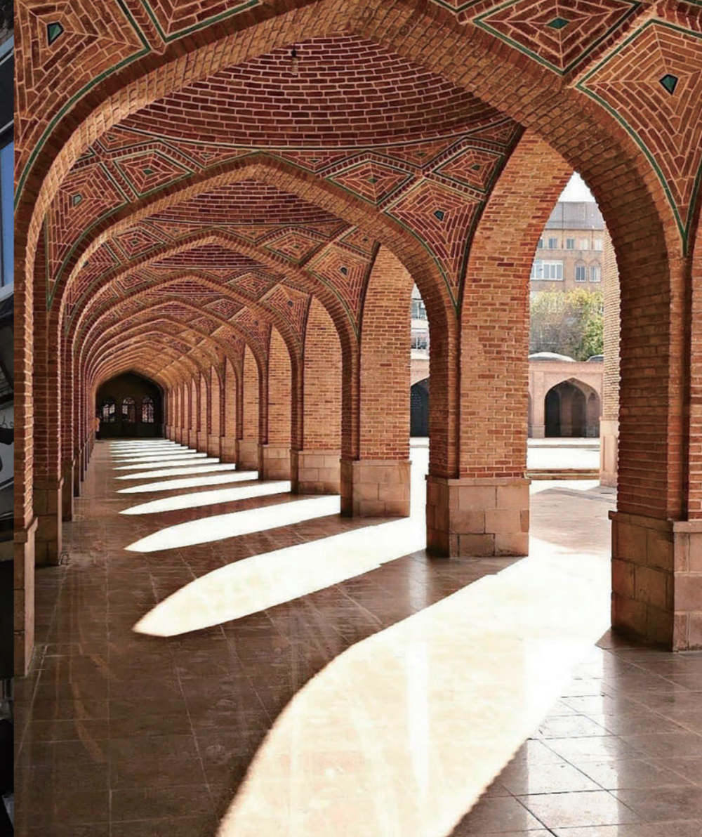
Tabriz / Heriz