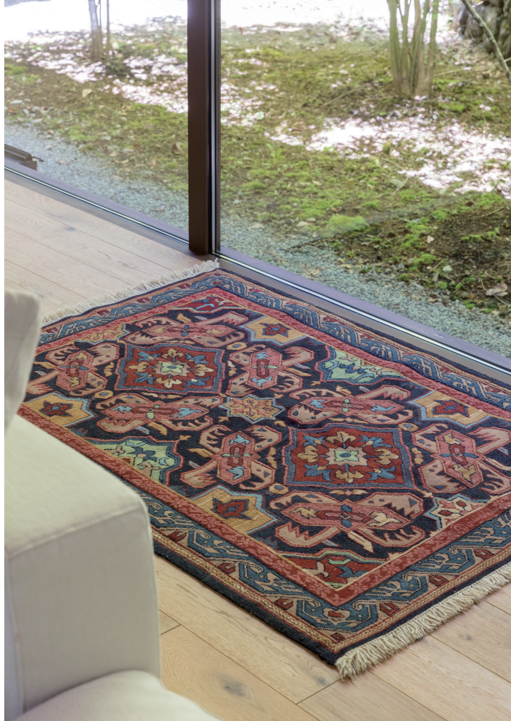
Right Lachin 149x104cm Azerbaijan Wool 真珠織