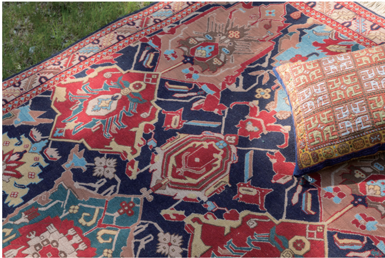
Left a. Azar 178×139cm Azerbaijan Wool 真珠織 b. Cushion35 41×37cm Azerbaijan Silk Cushion