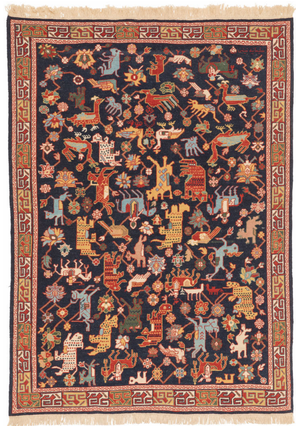
Left Elya 85×106cm Azerbaijan Wool 真珠織