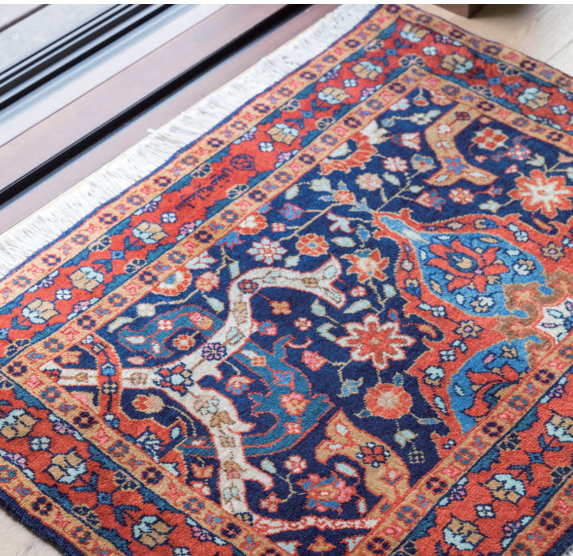
Tanso 65x94cm Tabriz Wool