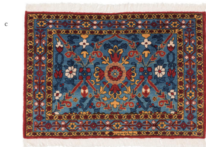
a. Yaprak 73x100cm Heriz Wool