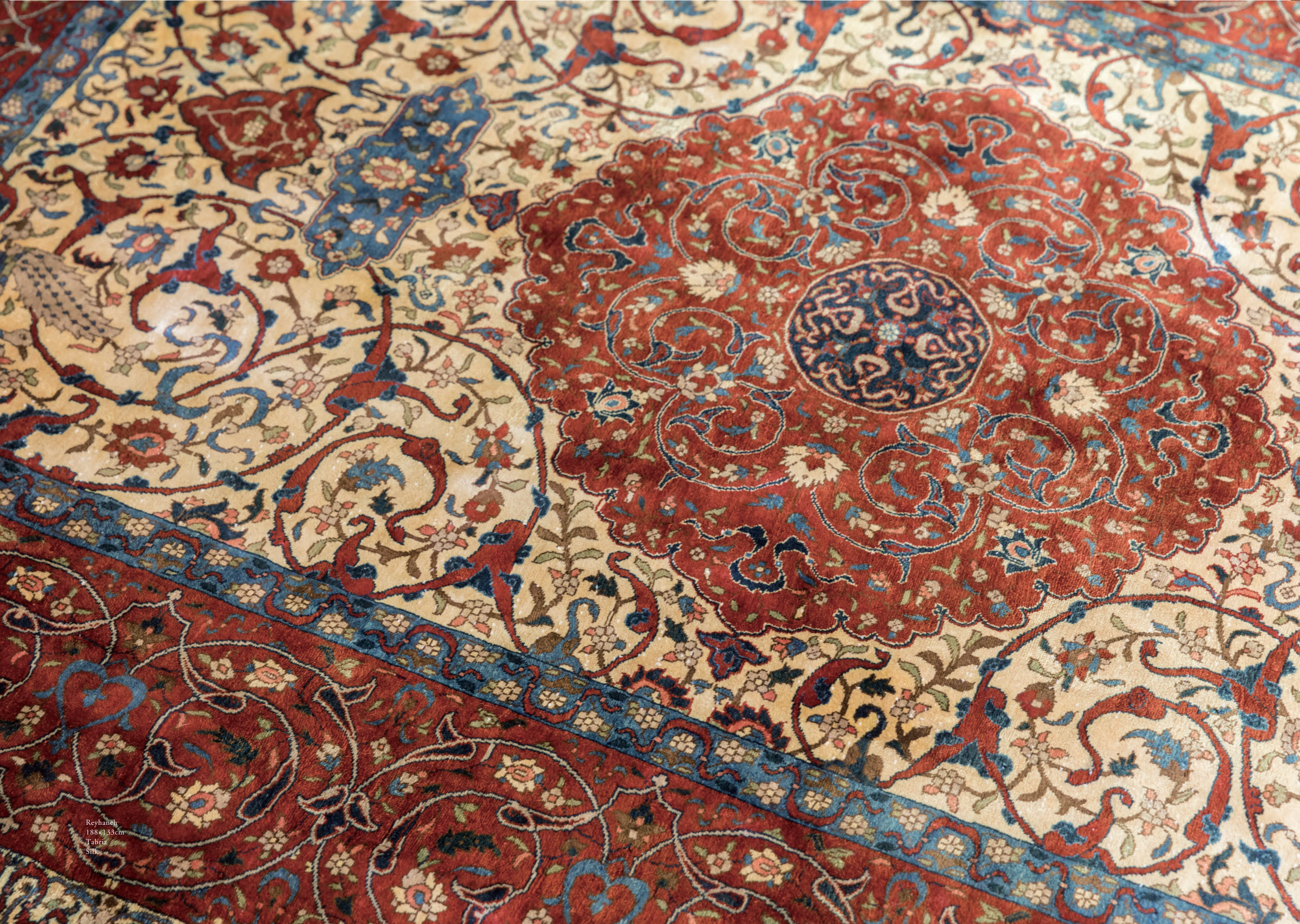
Reyhaneh 188x133cm Tabriz Silk