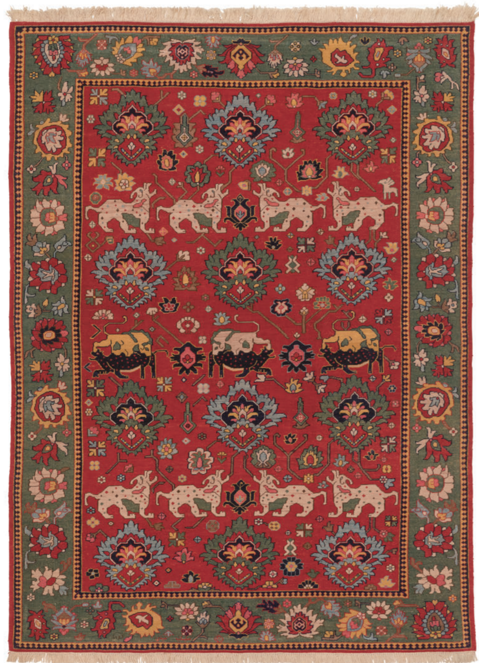
Left Gahlan 218x164cm Azerbaijan Wool 真珠織