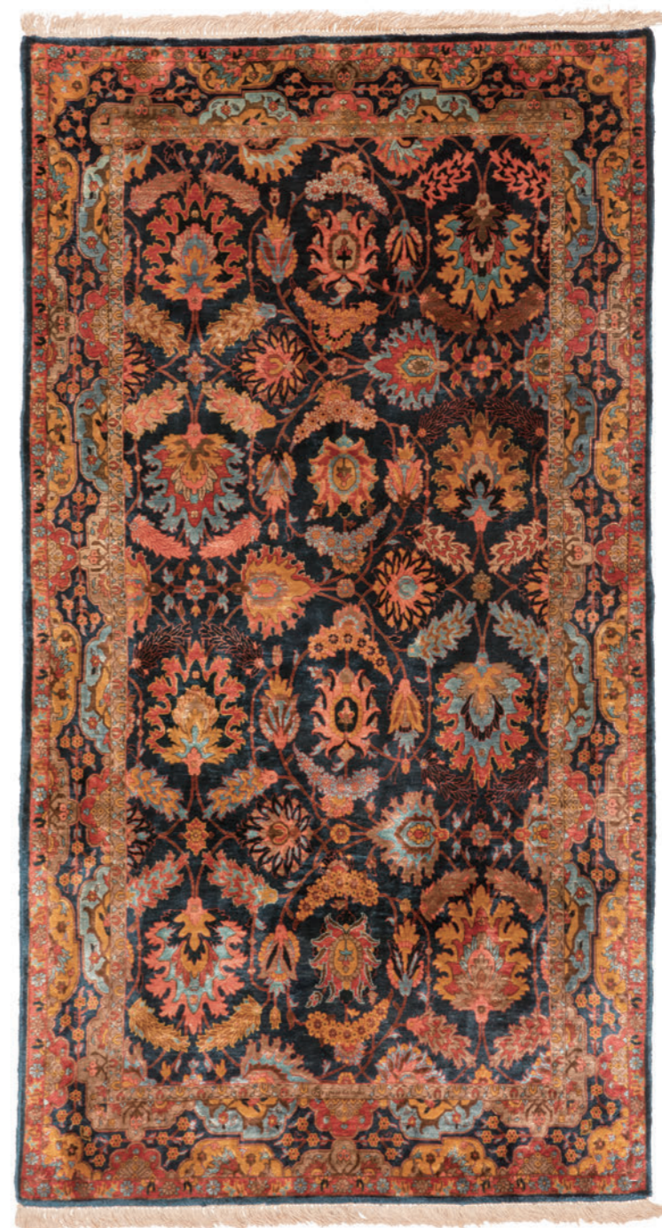
Elvin 171×94cm Tabriz Silk