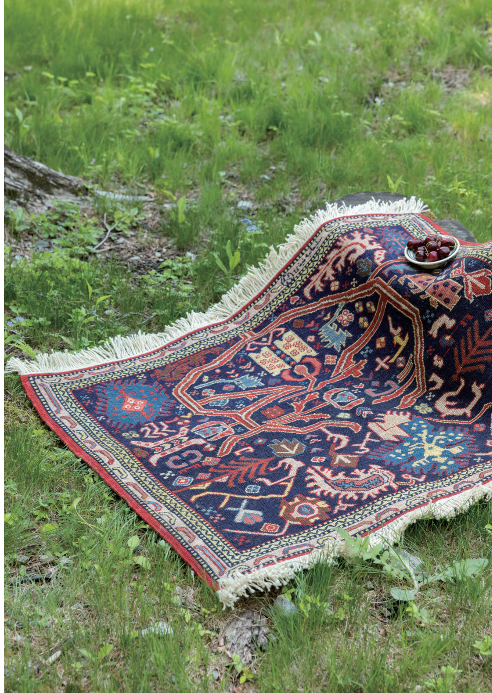
Right Aytem 80×104cm Azerbaijan Wool 真珠織