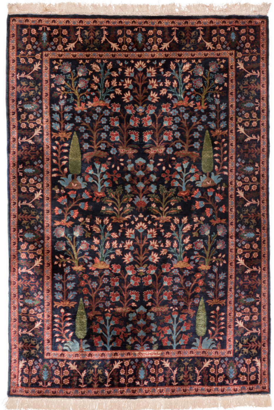
Taylan 132×90cm Tabriz Silk