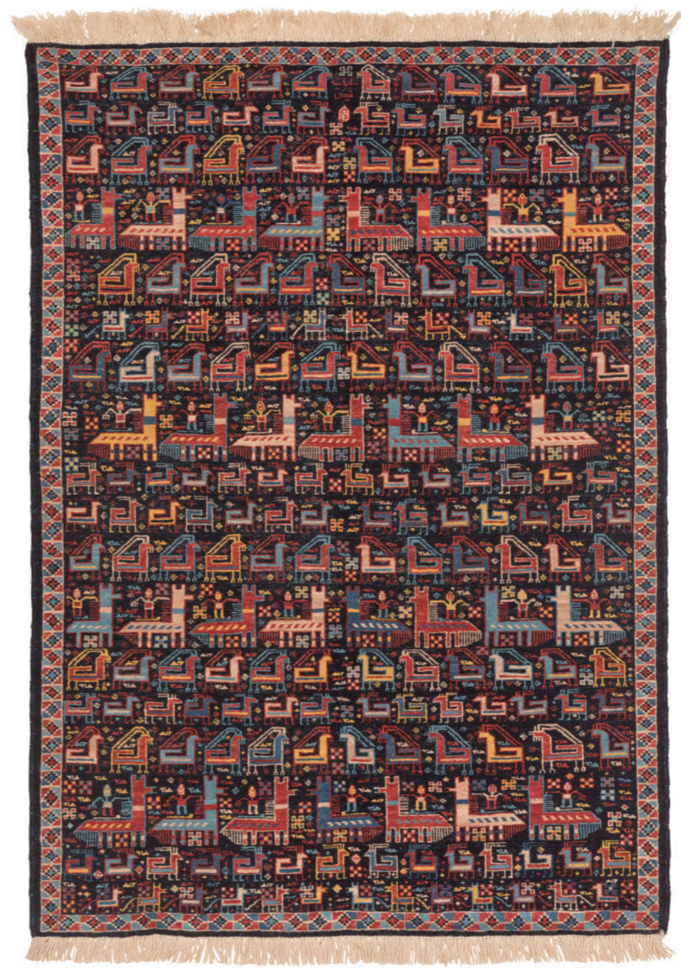
a. Kochlar 160x114cm Azerbaijan Wool Sumak b. Cushion35 42x36cm Azerbaijan Silk Cushion